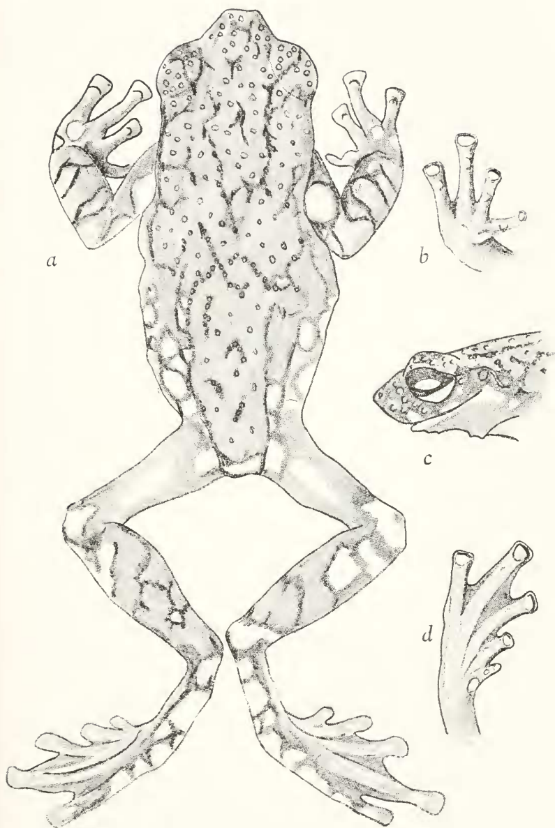
FIG. 1. Allophryne ruthveni , male (KU 69890); (a) Dorsum. (b) Thenar view of right hand. (c) Lateral profile of head. (d) Plantar view of right foot. \times 3.5 .